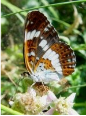
White Admiral ~ (Broxbourne Wood).