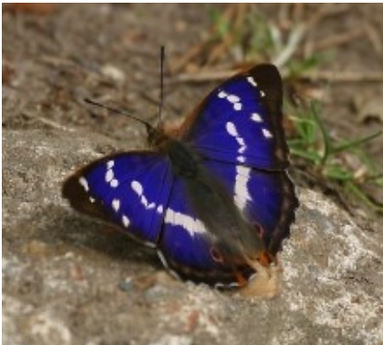
Purple Emperor at Broxbourne Wood, 2003.